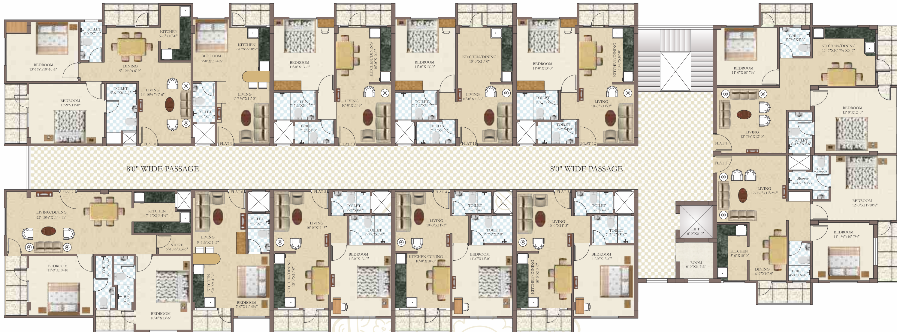
Saleable Area (Typical Floor Plan)