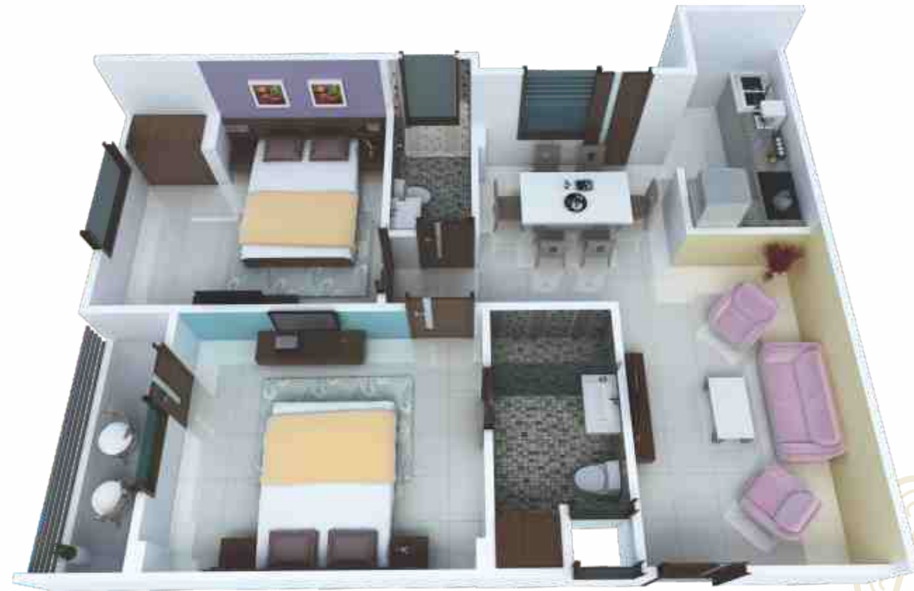
3D Module (View-1)